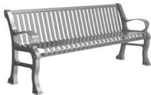
Maglin – 300 Series Bench (Middle Arm not Shown)