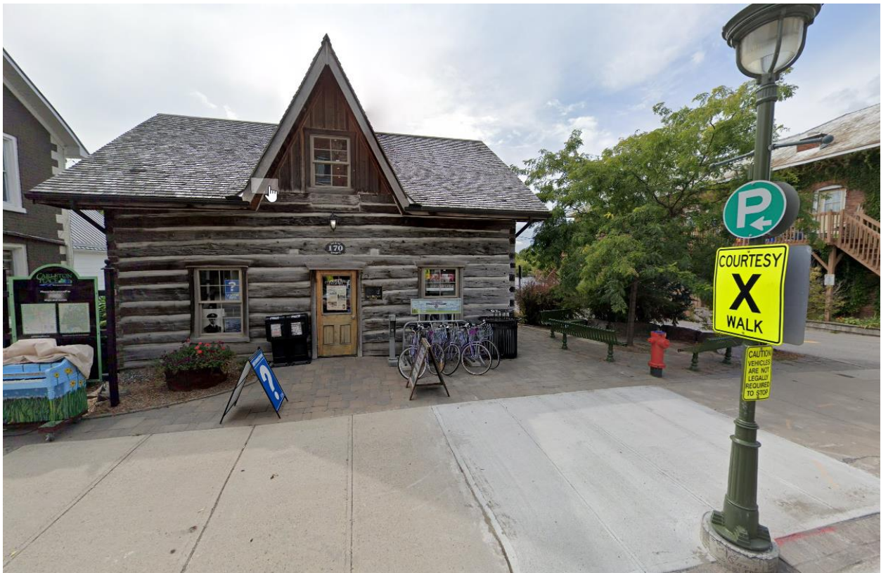
Figure 4: Existing Condition at Chamber of Commerce