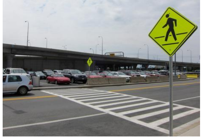
Standard Ladder Crosswalk