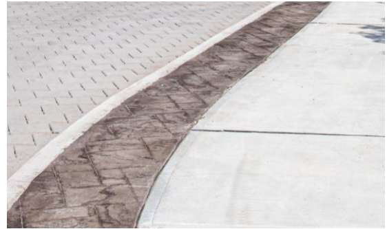
Coloured Impressed Concrete