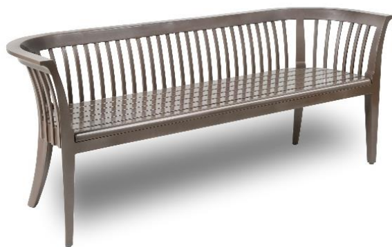
Landscape Forms – Melville Bench