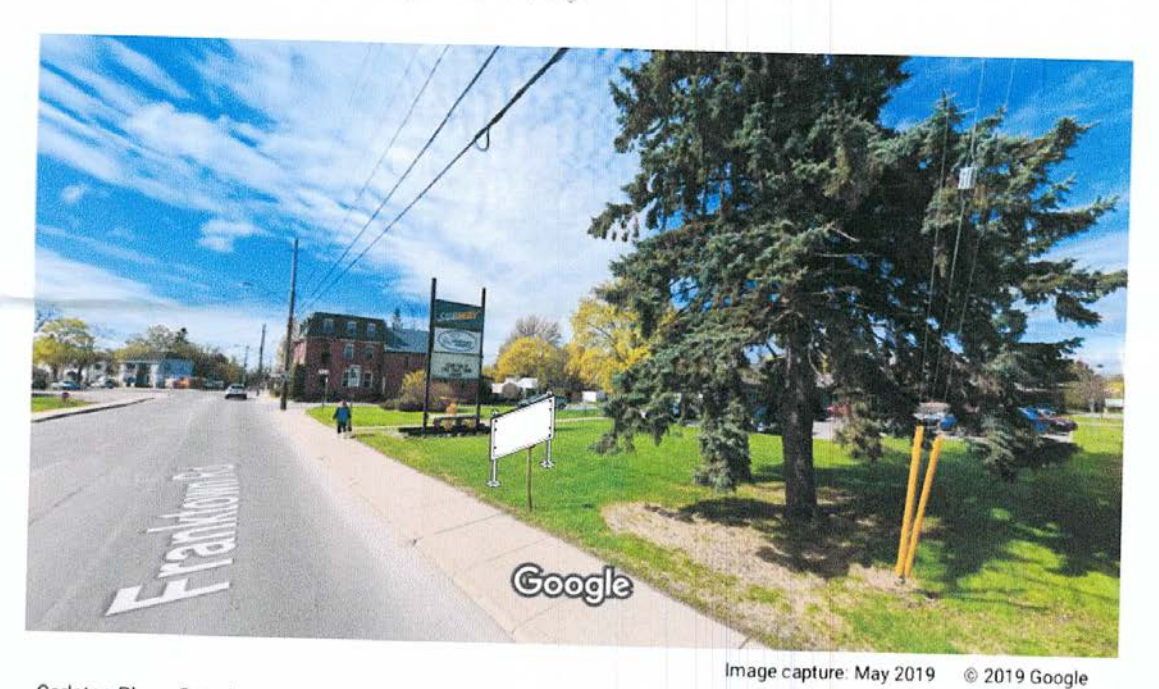
Carleton Place, Ontario