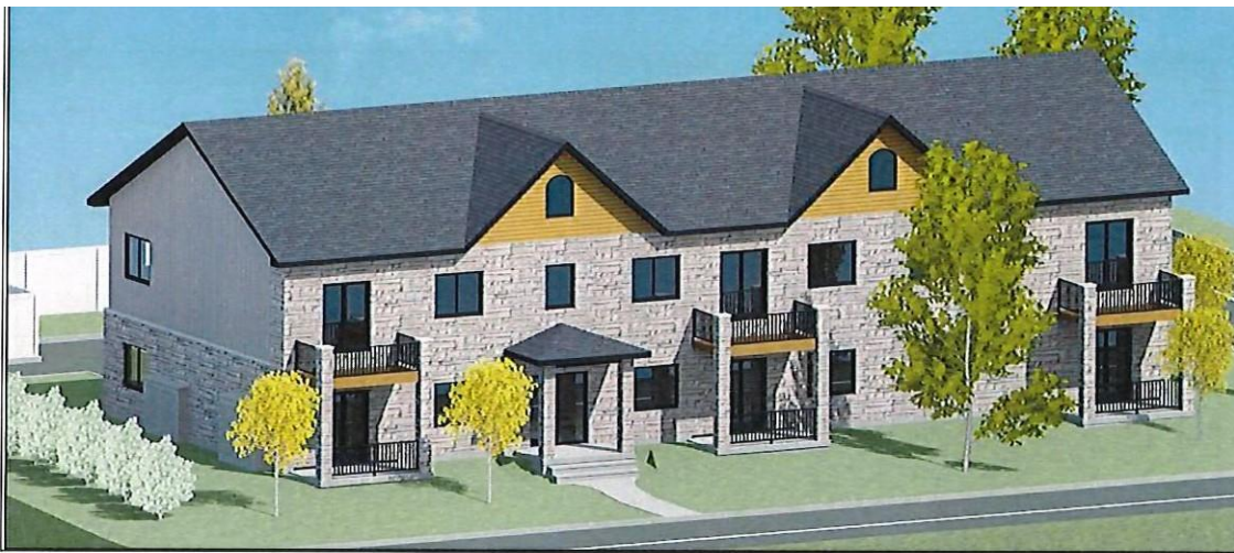
Figure 7. Building view from Bell Street

Below are the proposed elevations and site plan for the project: