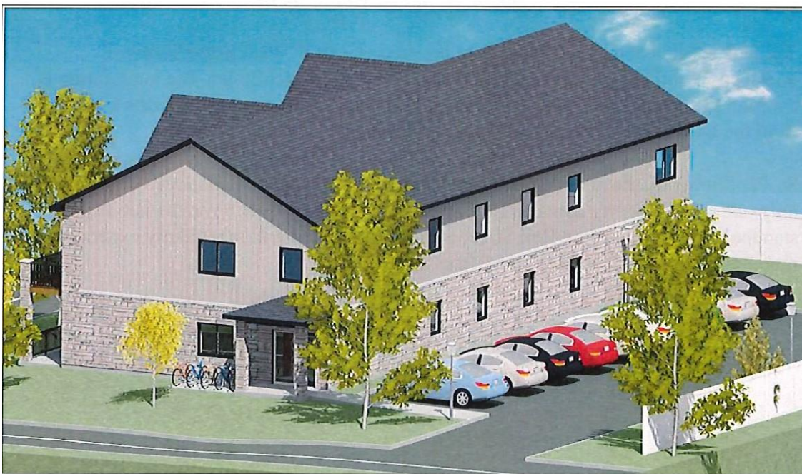
Figure 8. Building view from St. Paul Street

The parking for building is accessed off St. Paul street and hidden behind the building when viewed from Bell Street.