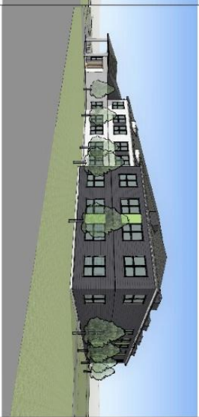
VIEW FROM SOUTHEAST