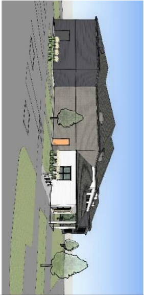
VIEW FROM WEST