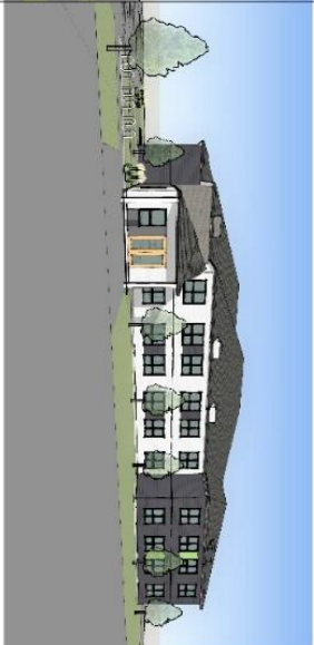
VIEW FROM SOUTH